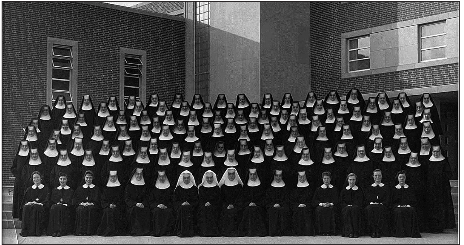
This photograph, circa 1963-64, shows the first group of Benedictine sisters who came from Ferdinand, Ind., to Beech Grove, and the first formation class that entered in Our Lady of Grace Monastery in Beech Grove. The sisters in formation are seated in the front row.