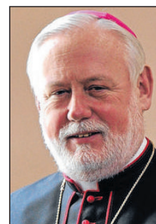
Archbishop Paul R. Gallagher

Christians found refuge with Yezidis after Islamic State fighters swept through Mosul, and the Yezidis are now being cared for by Christians further north after their communities fell into militants’ hands, he said.