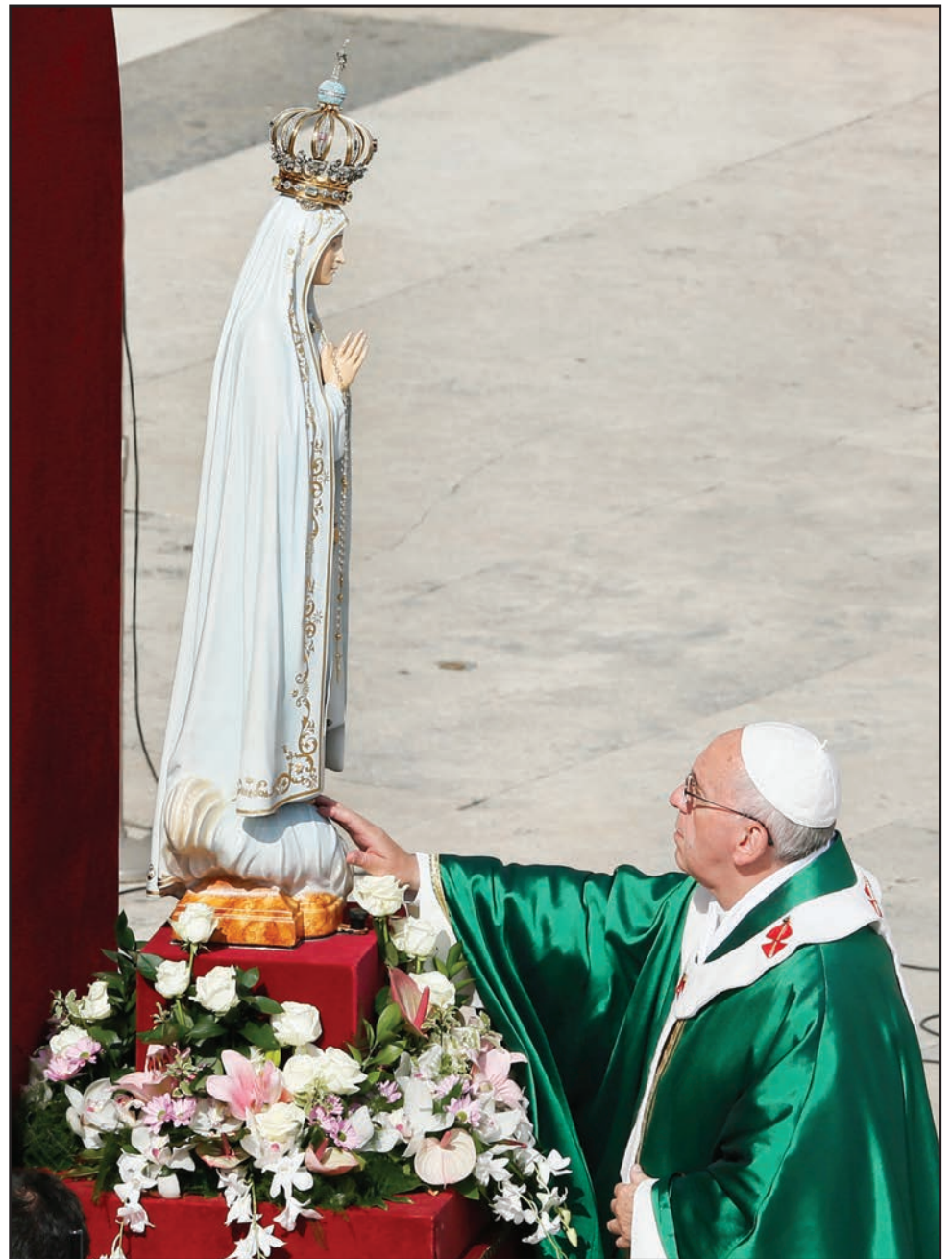
Pope Francis touches the original statue of Our Lady of Fatima after entrusting the world to Mary at the end of a Mass in her honor in St. Peter's Square at the Vatican on Oct. 13, 2013. The pontiff has encouraged the faithful to be devoted to Mary and value her humanity.

Women not only bring new life into the world; they also "transmit to us the capacity to see otherwise," and to "understand the world with different eyes, to feel the most creative, most patient,