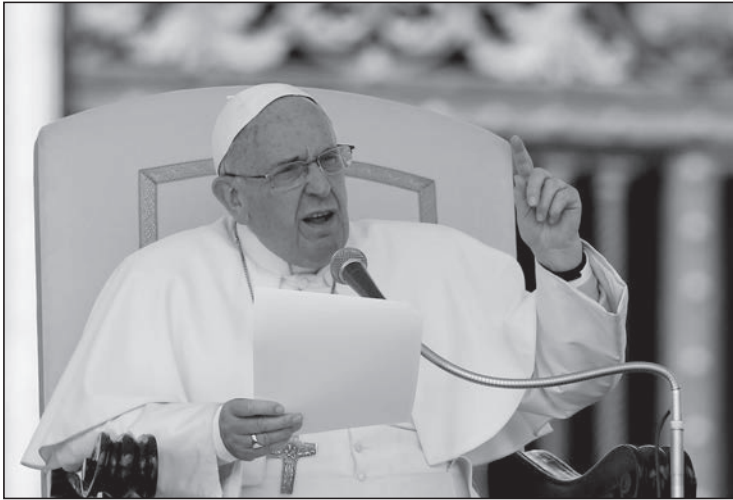
Pope Francis speaks during his general audience in St. Peter's Square at the Vatican on April 29.