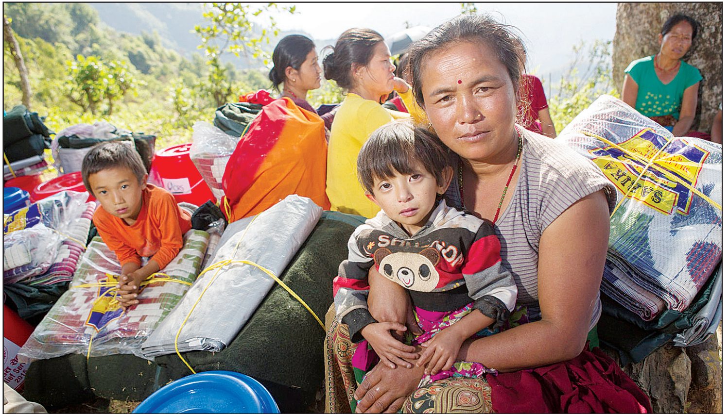
Earthquake survivors are seen amid aid supplies from Catholic Relief Services near a village in Gorkha, Nepal, on May 3.

Nepal were mobilizing all of their resources.