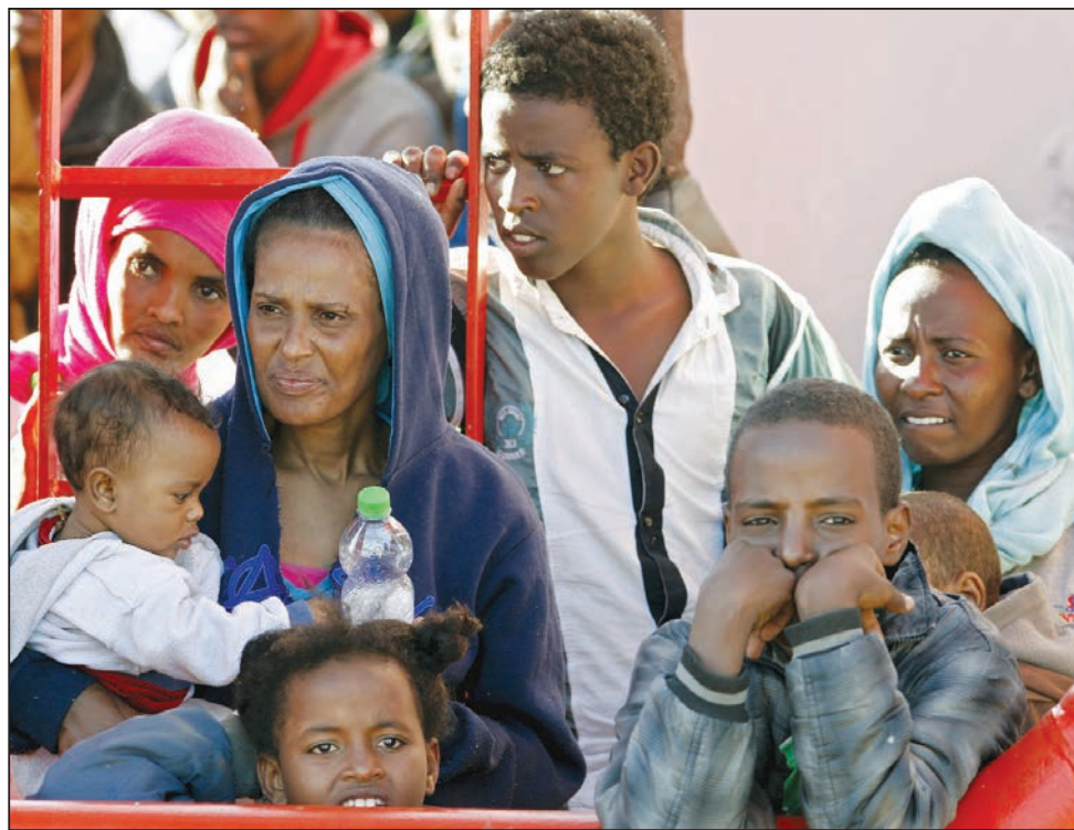
Migrants wait to disembark from a tug boat in the Sicilian harbor of Pozzallo on May 4. More than 3,600 migrants were rescued at sea in 17 different operations in just one day in early May, according to the Italian coast guard.

The World Council of Churches has urged Europe to take “collective responsibility,” rather than leaving the problem to border services in Greece, Italy and Malta, and to recognize the need to tackle “poverty, social instability