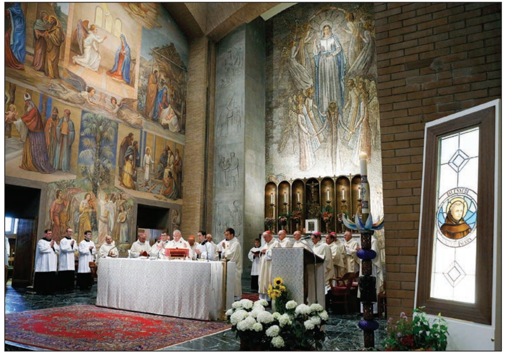
An image of Blessed Junipero Serra, right, is seen as Pope Francis celebrates Mass at the Pontifical North American College in Rome on May 2. It was the first papal visit to the U.S. seminary since 1980. At the end of Mass, Pope Francis said the visit to the seminary was "a beautiful and meaningful introduction to my apostolic visit to the United States of America."